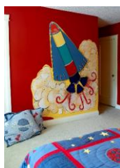
Rocket and Fire, Boy's bedroom

HOME DECOR: The Painted Wood Construction can also be integrated into fun children's rooms.