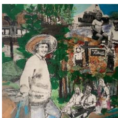
Mom, Canvas Collage

The CANVAS COLLAGE is an affordable collage style of art, created on a traditional canvas background. This is a collage product for those who prefer a more conservative instal of art.