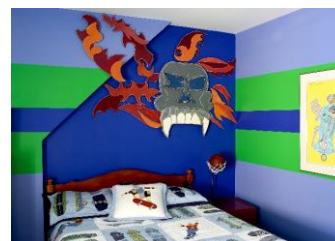
Skull, Boy's bedroom