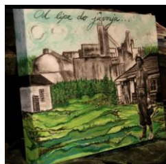
Od Lipe do Javorja, Canvas Collage

"Colours and shapes in motion captured in photography is magnificent for visual exploration and explanation. It's such a puzzle." ~Tania Rihar