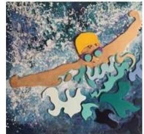
The Butterfly Swimmer

HOME DECOR: The Painted Wood Construction can also be integrated into fun children's rooms.