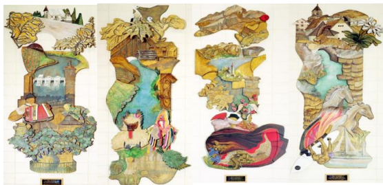
The Slovenia Rivers quadriptych

The artwork is created using a variety of thicknesses and types of PINE WOOD .