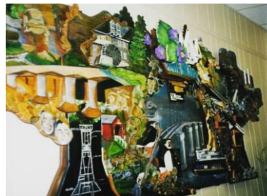
The Northumberland Bridge